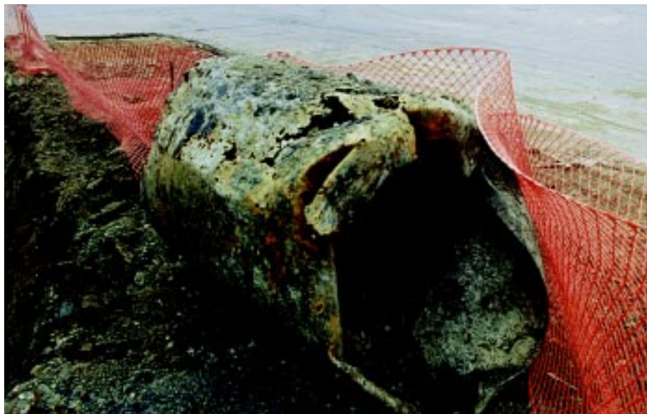
Excavated storage tank showing severe corrosion.

When compared to benzene, MTBE tends to partition strongly from the gas phase into the water phase if contaminated air is brought into contact with uncontaminated water. Given sufficient time, equilibrium can be established